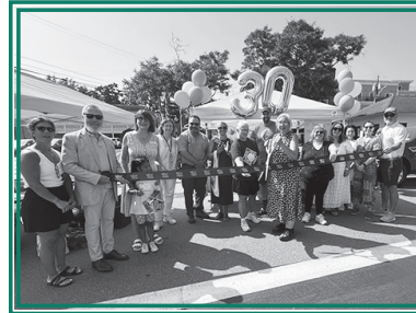
Ribbon Cutting on opening day, Sunday May 14