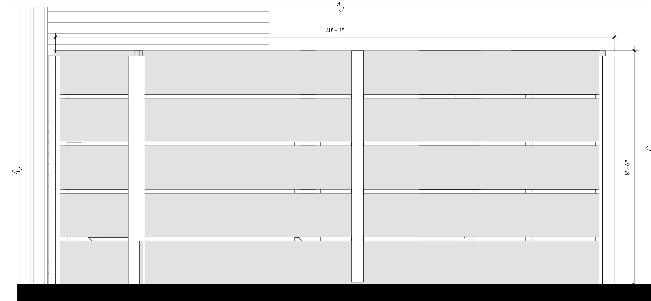
2 Elevation A A1.10 Scale: 1/2" = 1'-0"