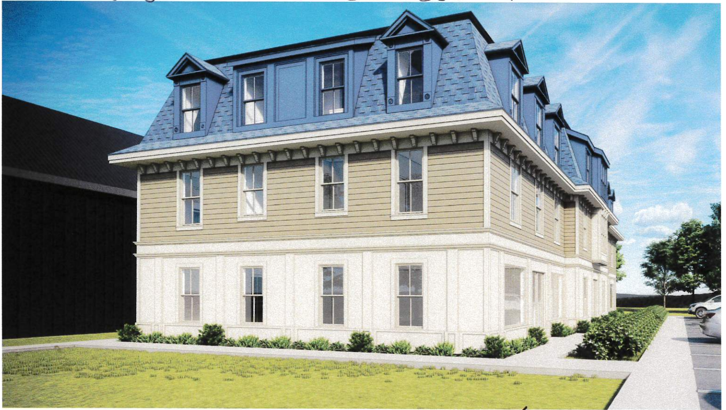
40 High St - Building Renderings - Lap- Gable Dormers

AHDRB prefers these third floor windows vs. 3rd floor windows submitted - "Dome" windows