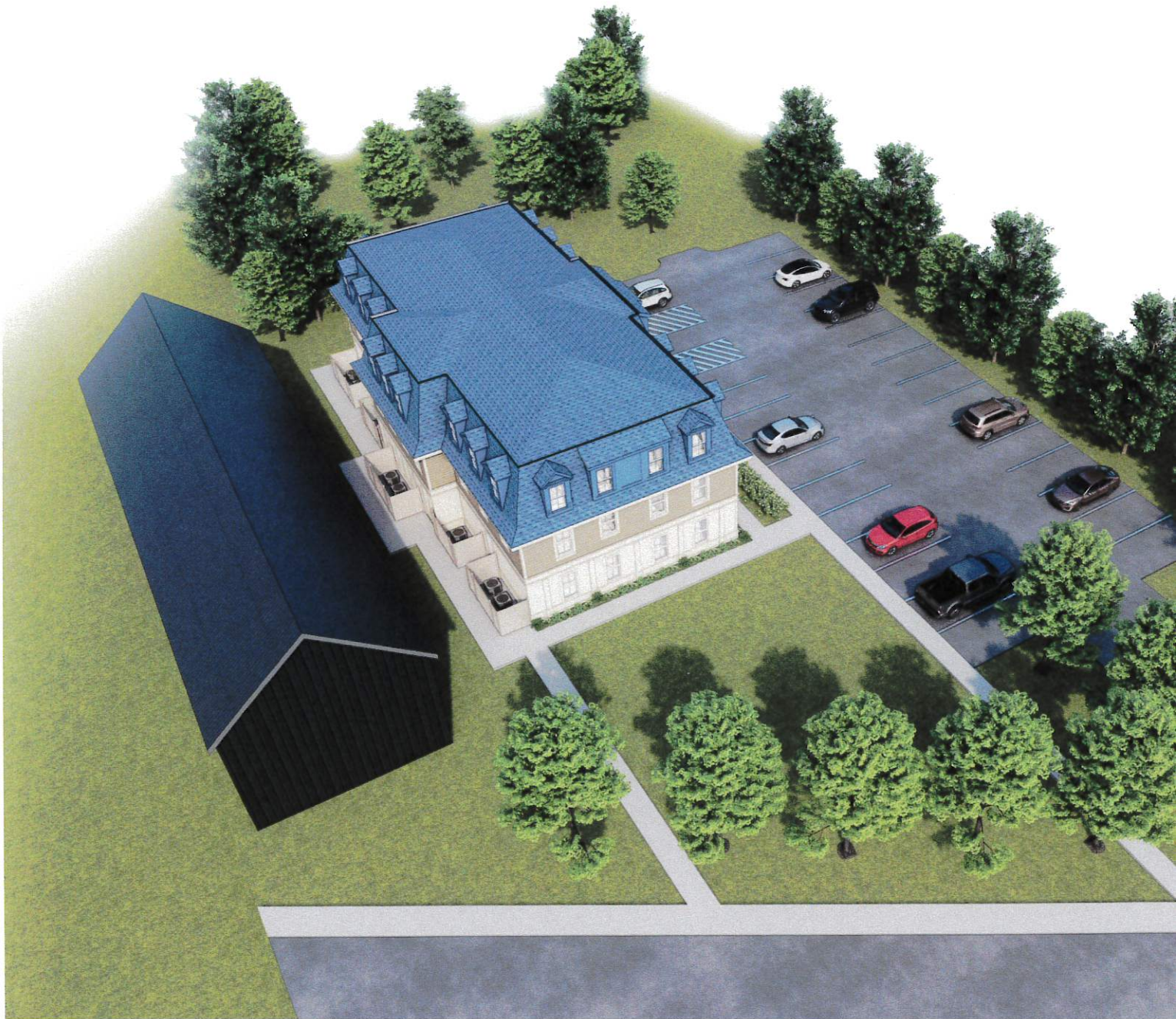
40 High St - Building Renderings - Lap- Gable Dormers