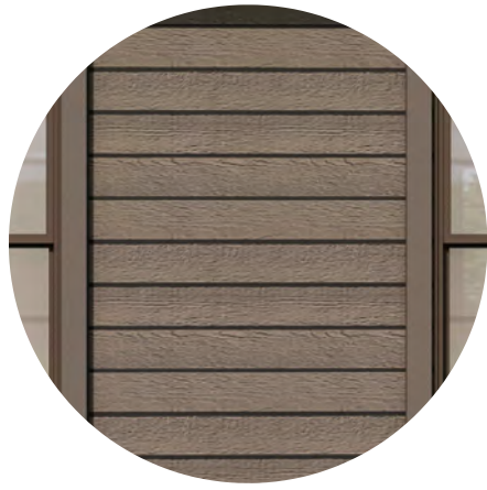
LP SMARTSIDE LAP SIDING IN TUNDRA GRAY