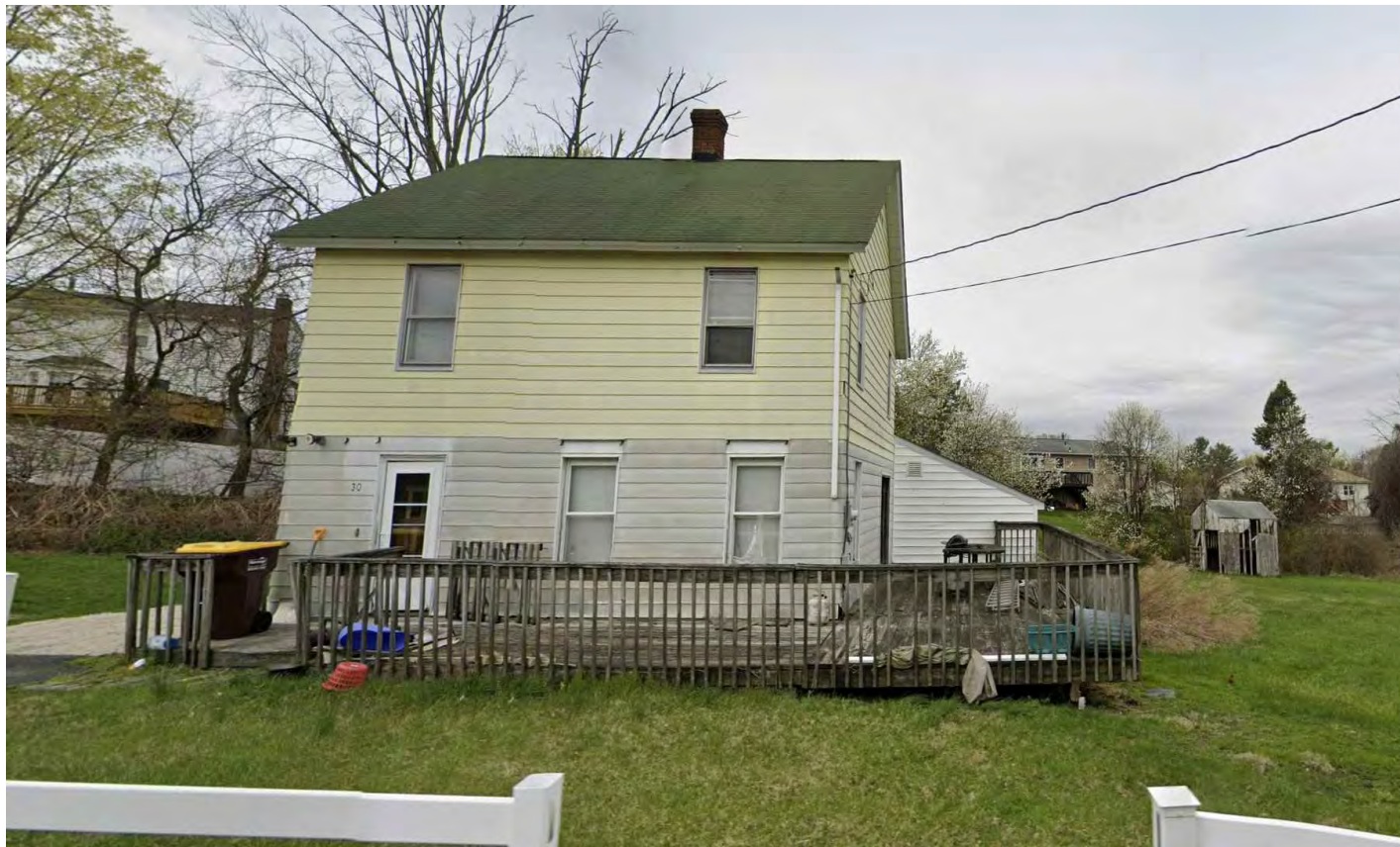
EXISTING FRONT PHOTOGRAPH