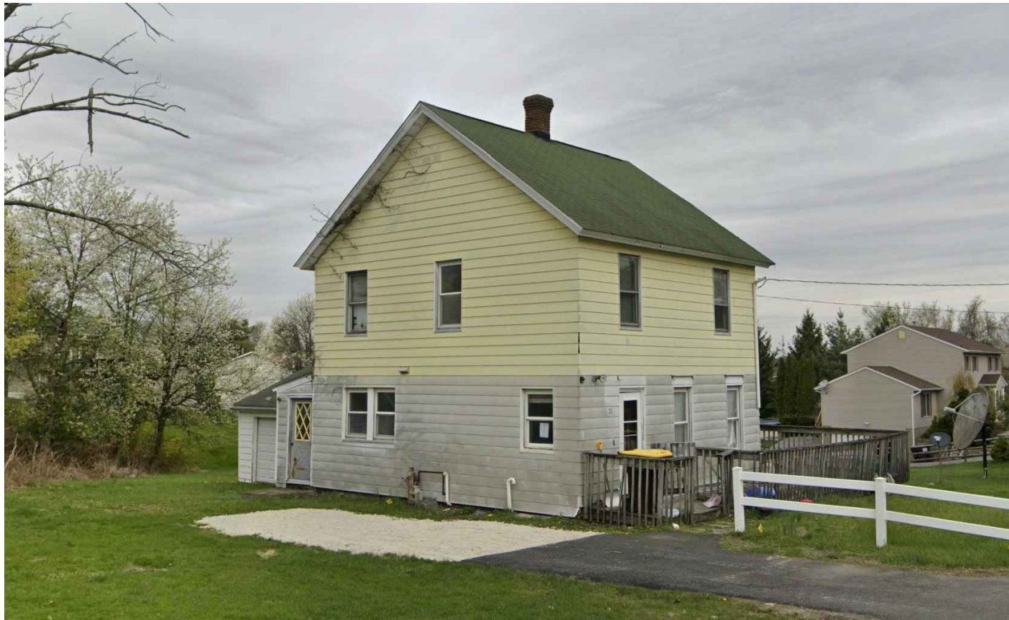
EXISTING LEFT SIDE PHOTOGRAPH