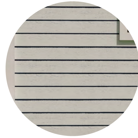
LP SMARTSIDE LAP SIDING IN SNOWSCAPE WHITE