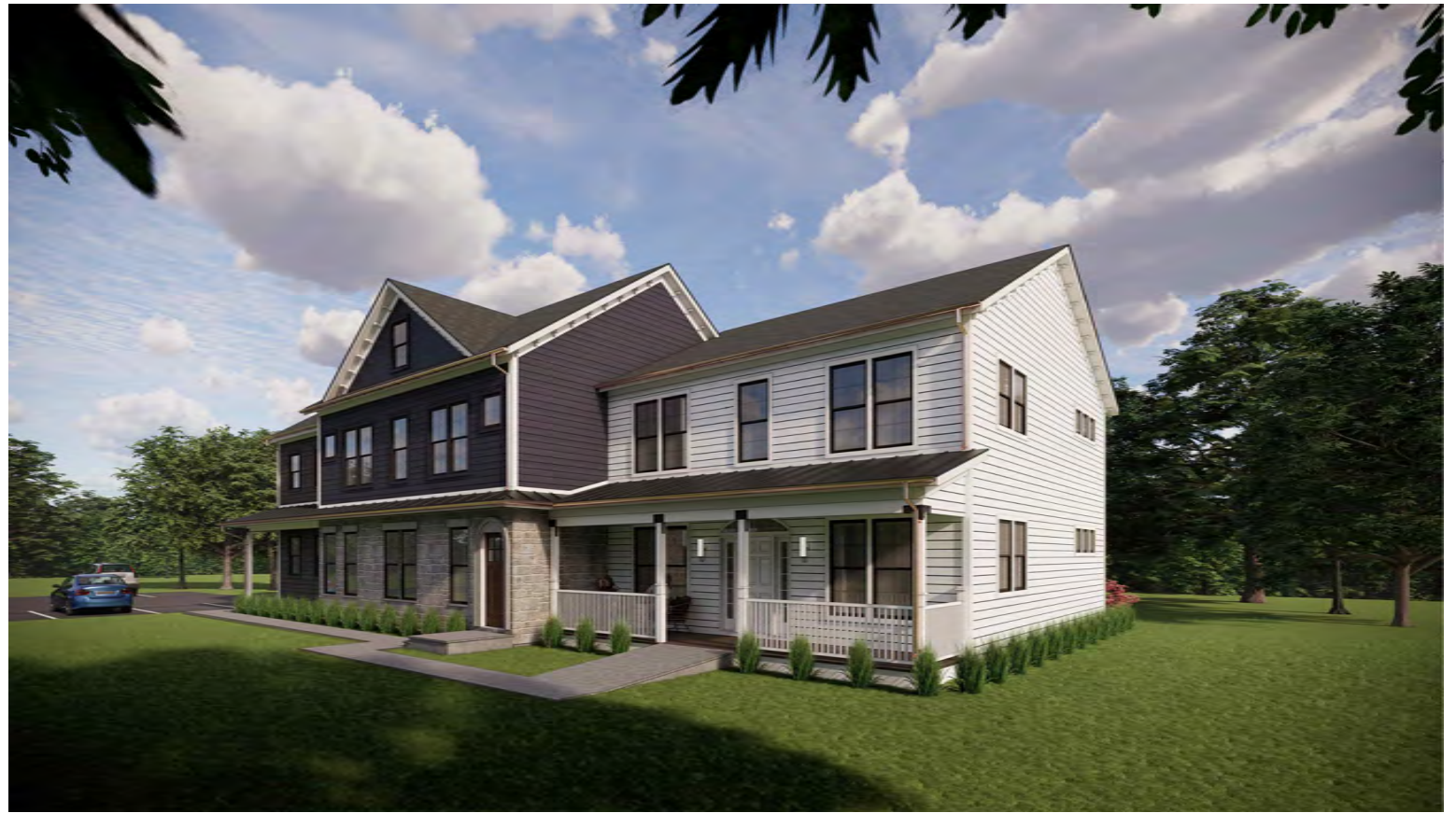
FRONT RIGHT CORNER