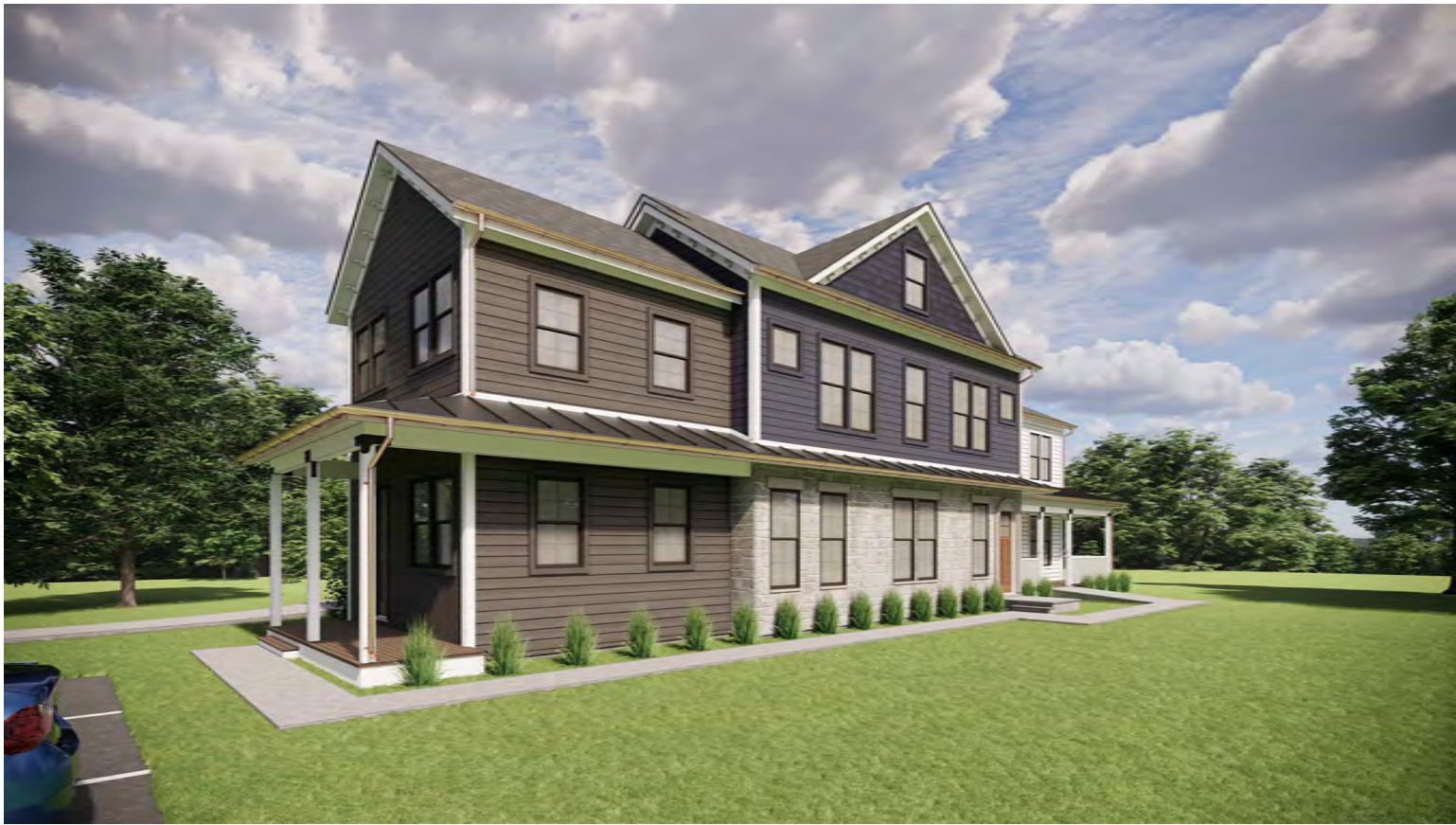
FRONT LEFT CORNER