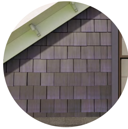
LP SMARTSIDE SHAKE LAP SIDING IN MIDNIGHT SHADOW