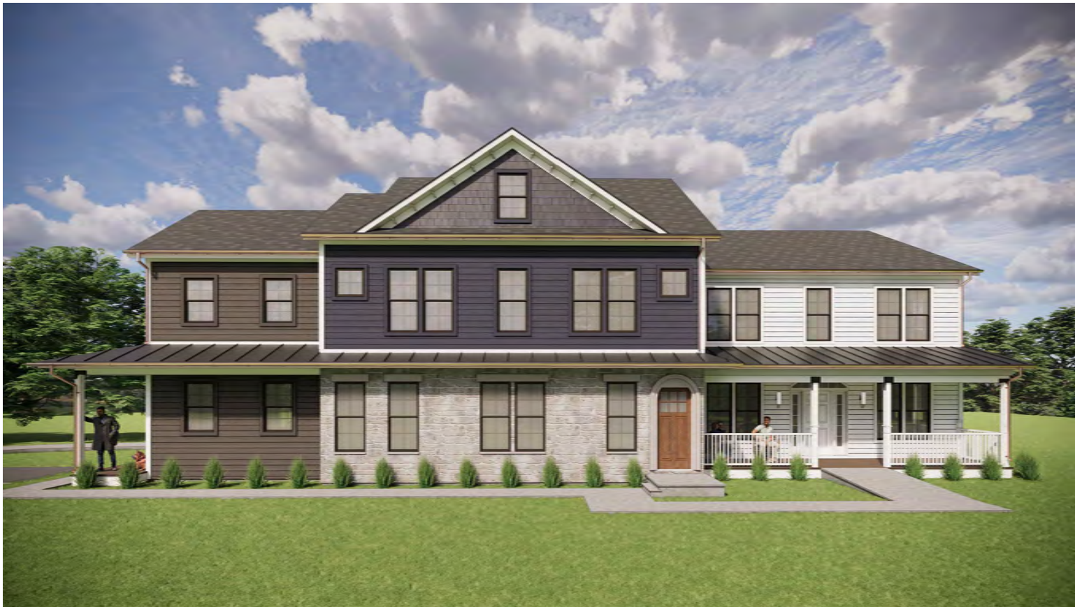
FRONT VIEW RENDERING