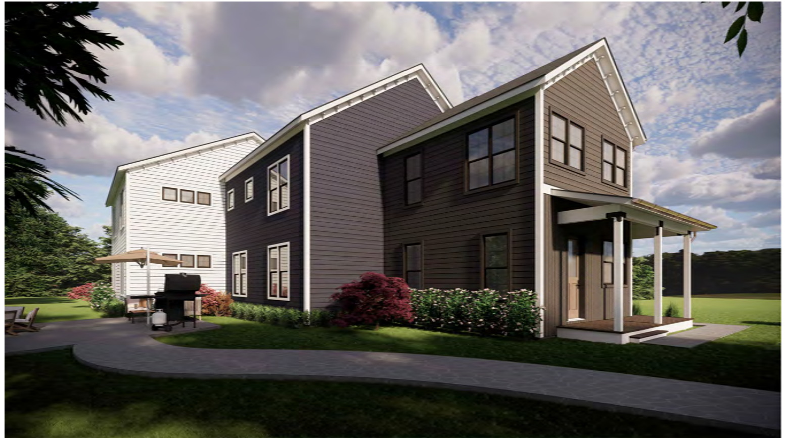
REAR LEFT CORNER