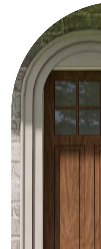
DOOR FINISH: BENJAMIN MOORE: THATCHED ROOF WOODLUXE SOLID STAIN