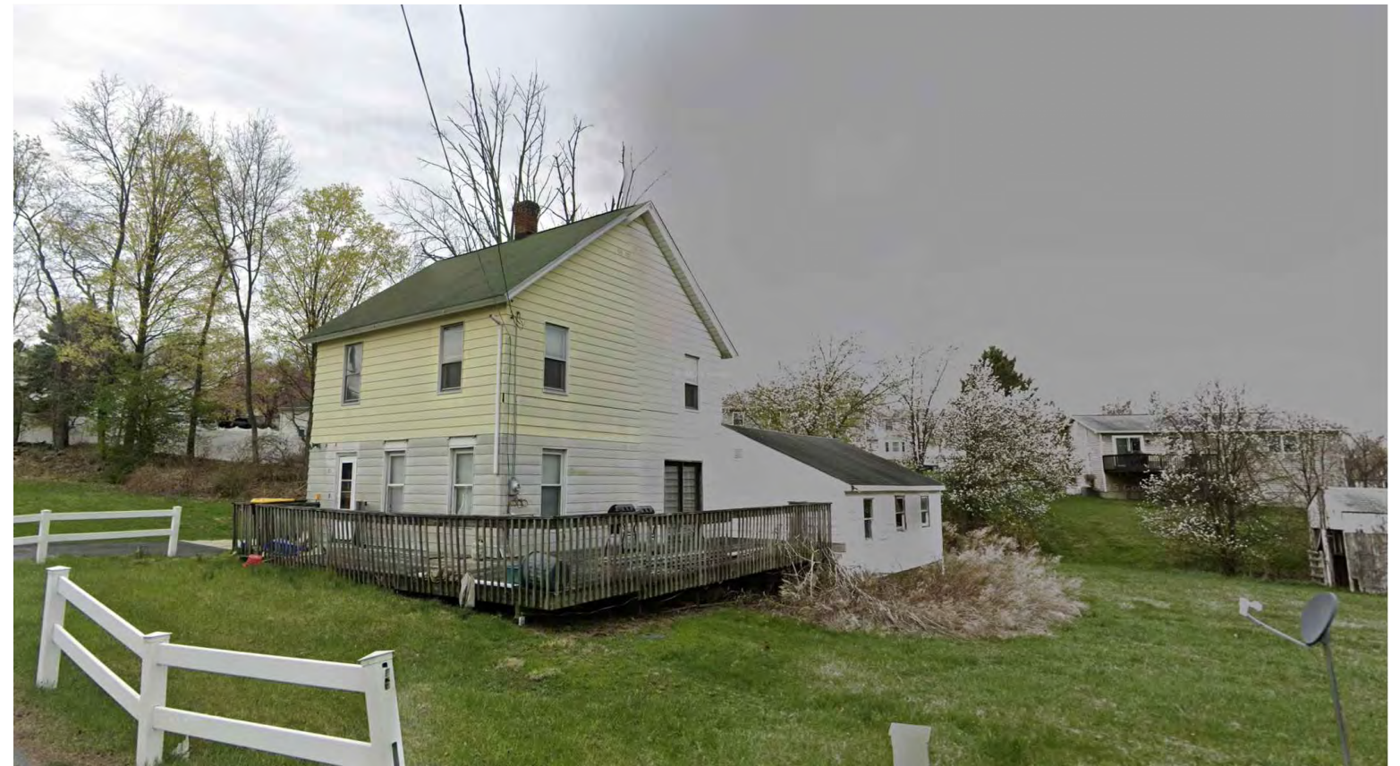
EXISTING FRONT RIGHT CORNER PHOTOGRAPH