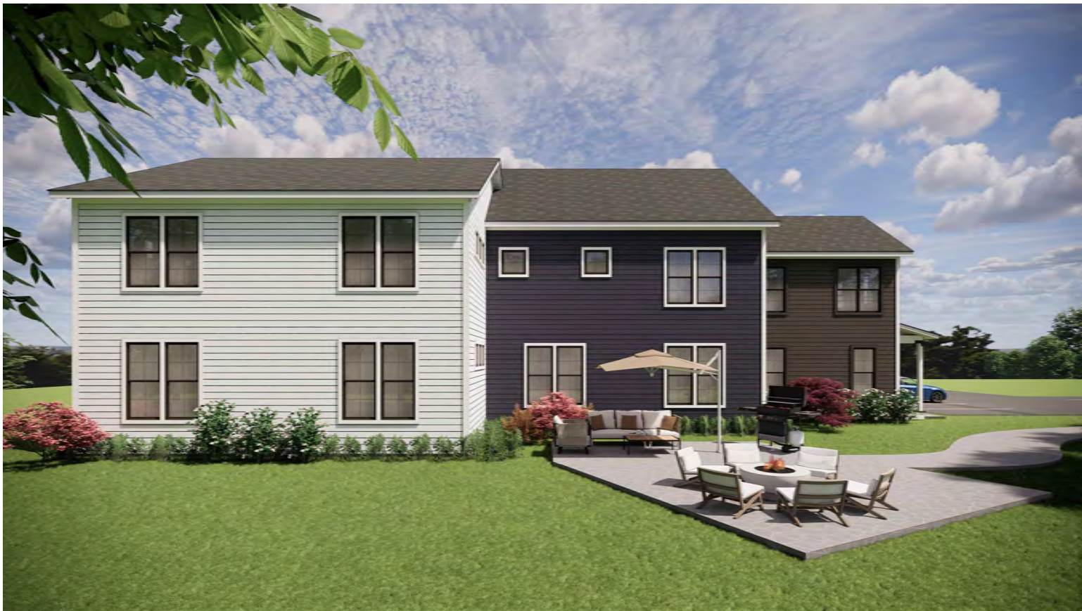
REAR VIEW RENDERING