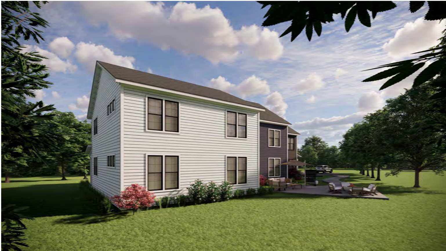
REAR RIGHT CORNER