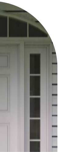
DOOR FINISH: BENJAMIN MOORE W09601 WHITE SOFT GLOSS ACRYLIC EXTERIOR