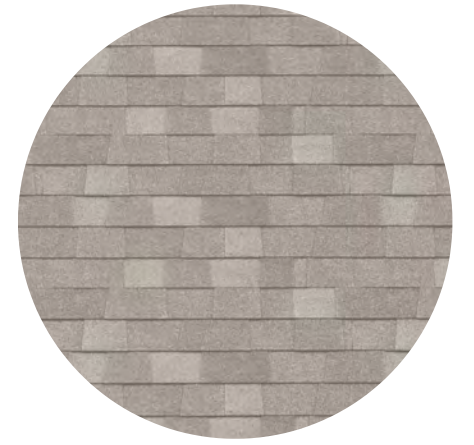
OWENS CORNING DURATION TRUDEFINITION SHINGLES IN SLATESTONE GRAY