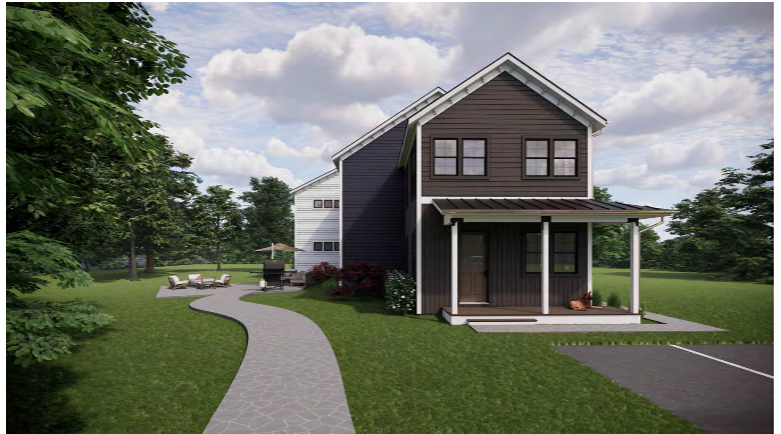
LEFT SIDE RENDERING