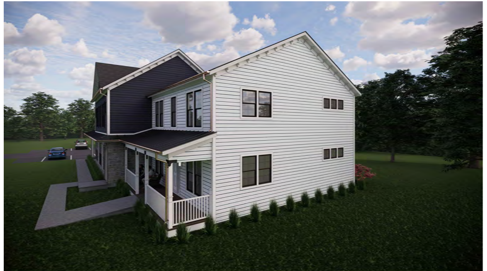
RIGHT SIDE RENDERING