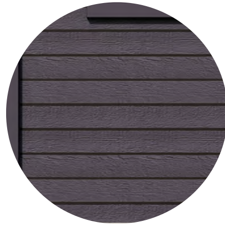
LP SMARTSIDE LAP SIDING IN MIDNIGHT SHADOW