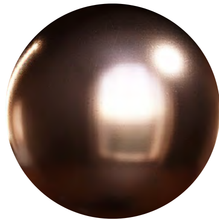
HAMMERED COPPER GUTTERS & LEADERS