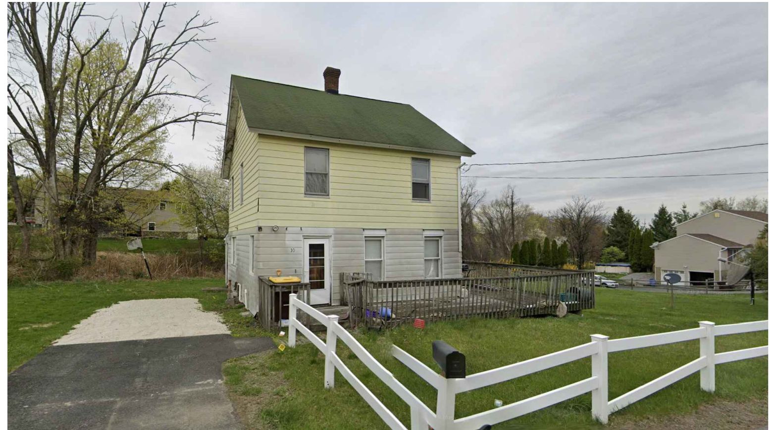
EXISTING FRONT CORNER PHOTOGRAPH